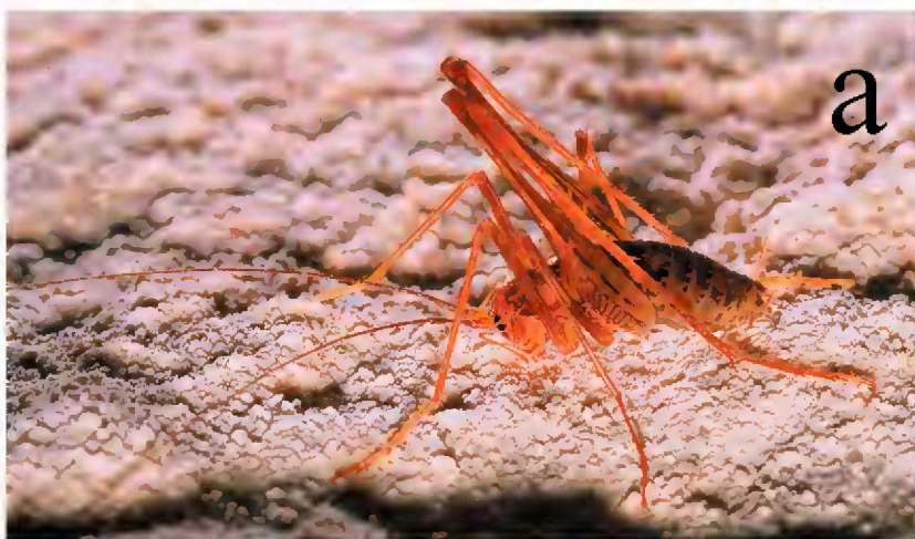
Figure 3 (below). Examples of Jenolan cave fauna, approximate length (including legs) indicated (photographer). a. Cavernotettix cave cricket, 25 mm (Stefan Eberhard); b. Badumna socialis 16 mm (Mike Gray); c. Stiphidion facetum (with dipteran prey), 25 mm (Stefan Eberhard); d. Web of S. facetum (Helen Smith); e. Laetesia weburdi , 5 mm (Mike Gray); f. Holonuncia cave harvestman, 20 mm (Stefan Eberhard).